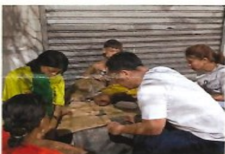
MINISTRY TO THE HOMELESS