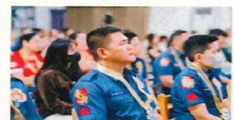
Policemen Attending ODBC's 20th Anniversary