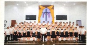
Soli Deo Gloria Choir

"And I thank Christ Jesus our Lord, who hath enabled me, for that he counted me faithful, putting me into the ministry;" I Timothy 1:12