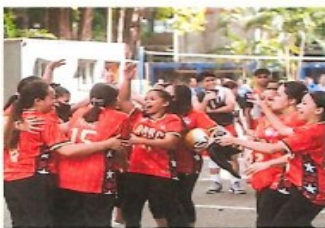
SPORTS & TEAM BUILDING