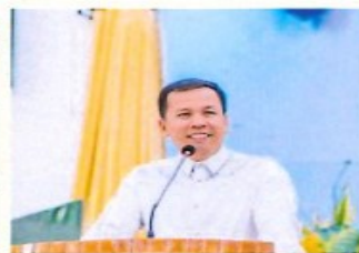
MISSION CHURCH PASTORS